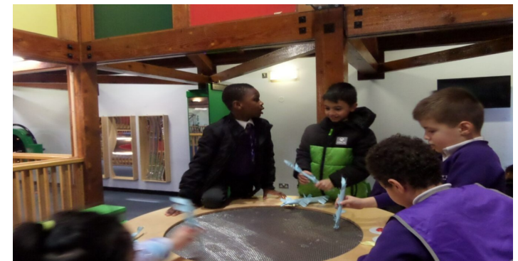
On Monday year 2 went to the Look Out Discovery Centre—here are a few pictures from their day.